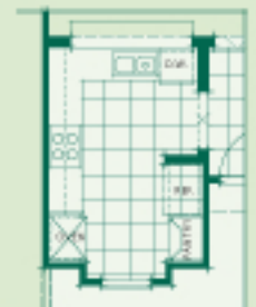
OPTIONAL KITCHEN LAYOUT